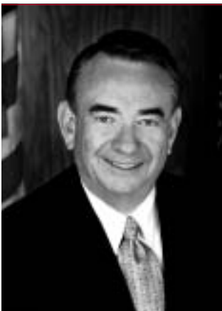
Tommy G. Thompson, Co-Chair Former Secretary of Health and Human Services and four-term Governor of Wisconsin, Tommy Thompson is a partner at the law firm of Akin Gump Strauss Hauer & Feld.

This year, Children’s HeartLink formed an International Advisory Board, consisting of experts in health care, public affairs and international development who provide Children’s HeartLink expertise and consultation in areas such as strategic planning, capacity building, international relations and medical diplomacy.