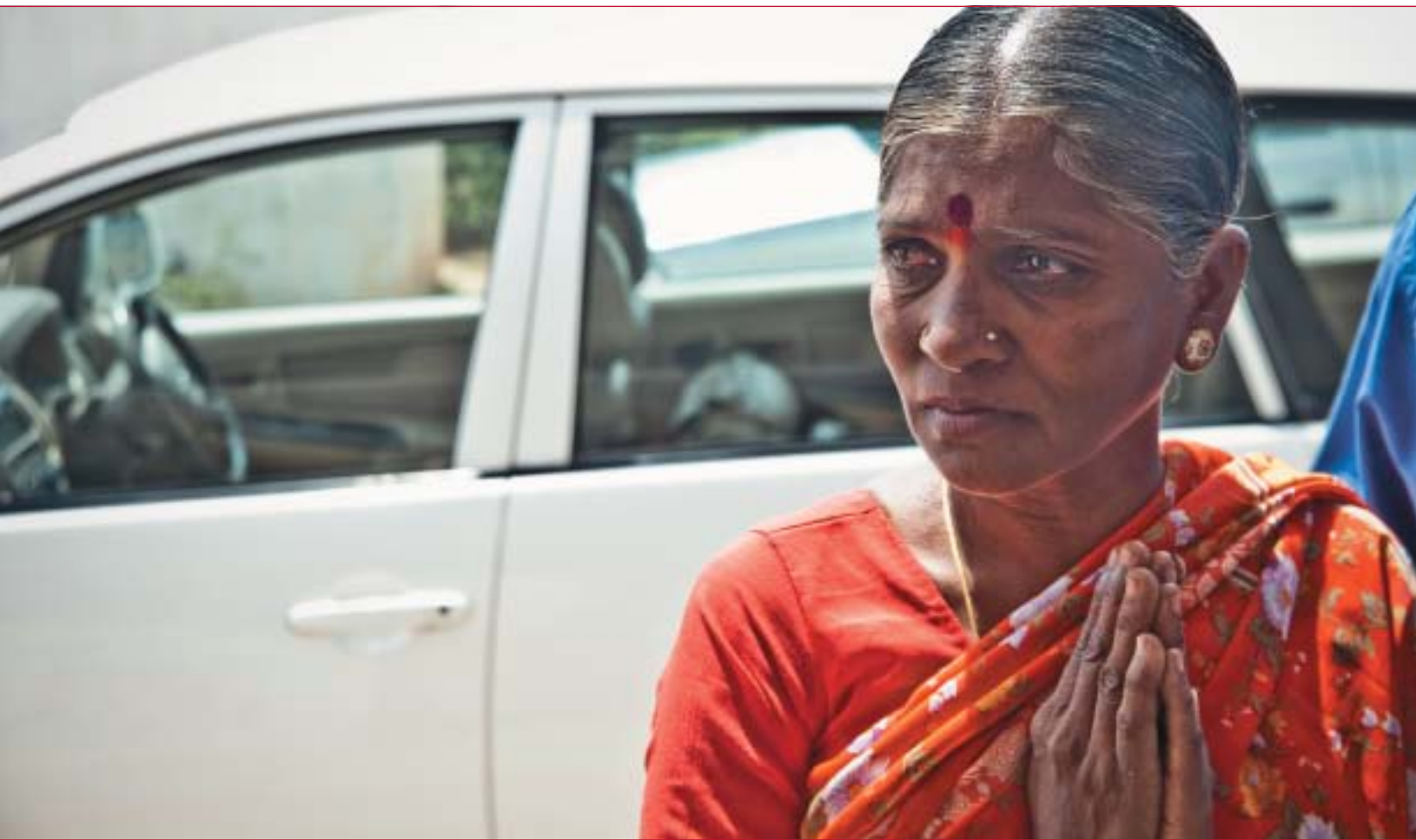
A patient's grandmother expresses her gratitude that her granddaughter will receive treatment at Inova Children's Heart Hospital in Hyderabad, India.

We are also building our reputation as a global leader in sustainable pediatric cardiac care. This year, we introduced our new International Advisory Board, co-chaired by former Secretary of Health and Human Services Tommy G. Thompson and former Senate Majority Leader Tom Daschle. We look forward to the expertise, advocacy and new connections this advisory board will bring to our organization.