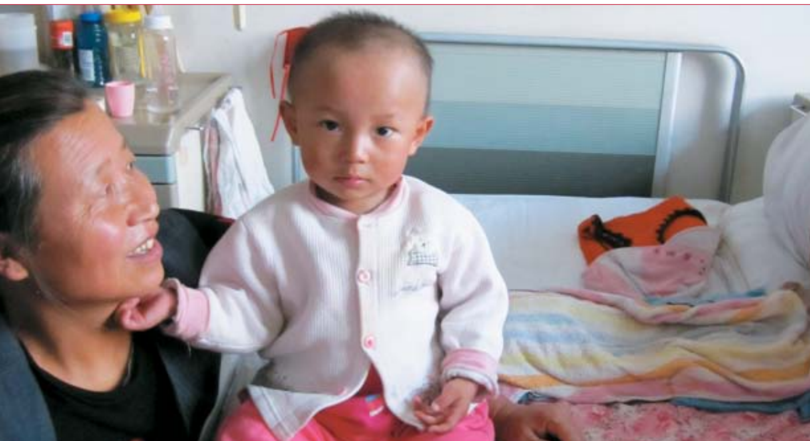
A patient at Children's HeartLink partner site First Hospital of Lanzhou University in Lanzhou, China.

81% Program Expenses 14% Fundraising 5% Management