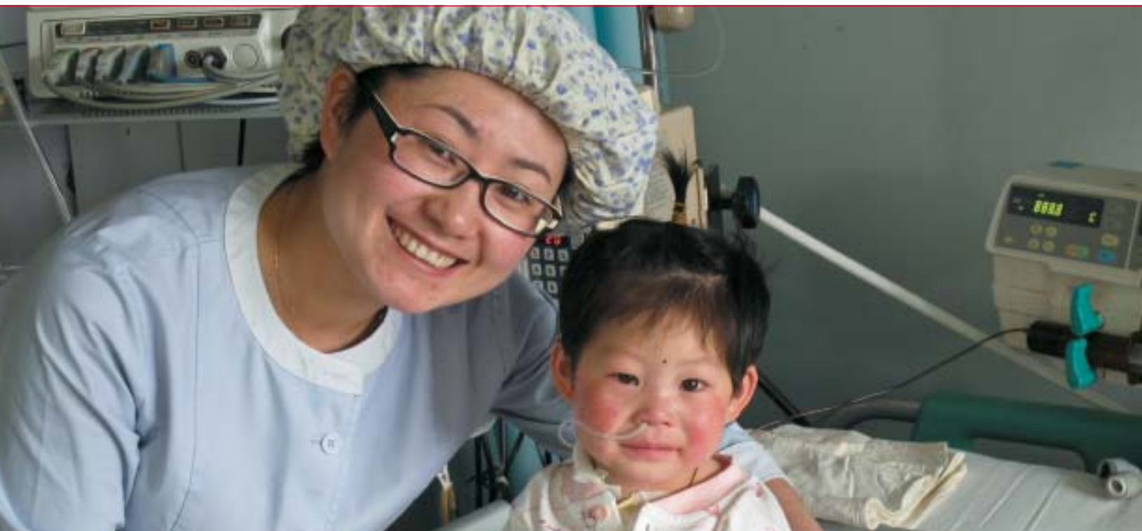
A patient at Children's HeartLink partner site First Hospital of Lanzhou University in Lanzhou, China.

*AGA Medical Corporation is now part of St. Jude Medical, Inc.