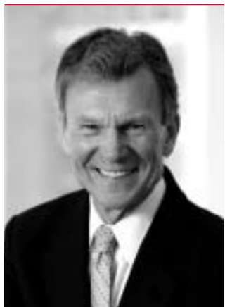
Thomas Daschle, Co-Chair Former U.S. House of Representatives member and U.S. Senator from South Dakota, Senator Daschle became the only individual to serve twice as both Senate Majority and Minority Leader. Currently, Senator Daschle is a Senior Policy Advisor to the law firm of DLA Piper.