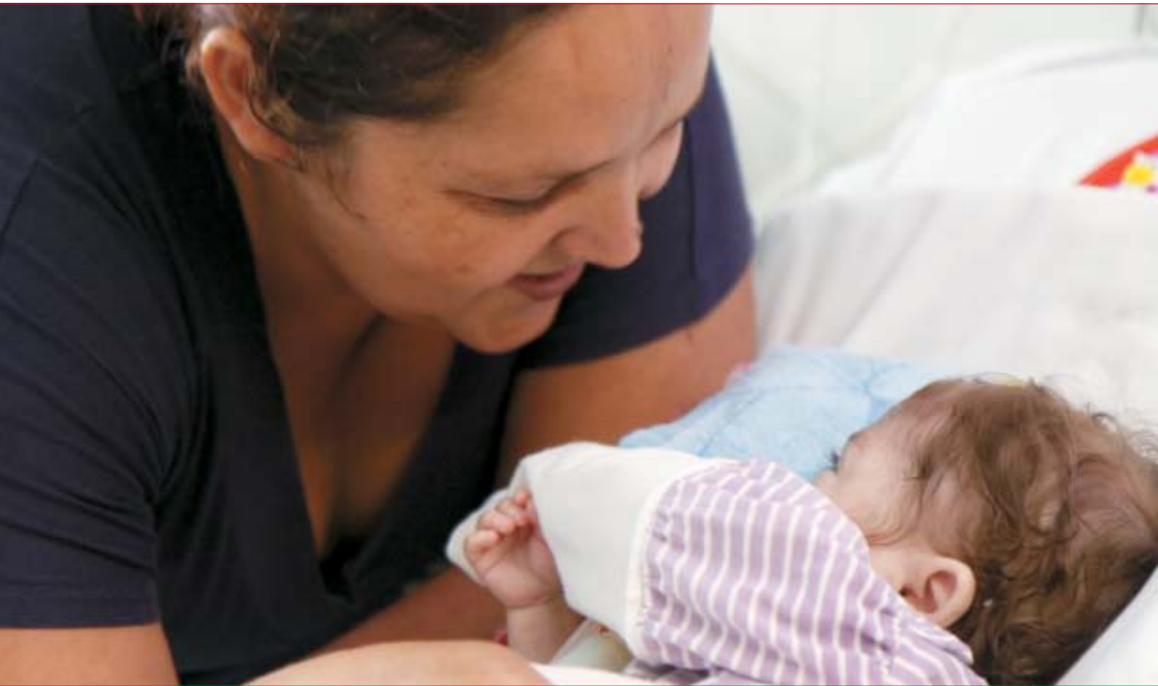
A patient smiles with her mother at Hospital de Base in Brazil.

Stanford University's Lucile Packard Children's Hospital, University of Minnesota Amplatz Children's Hospital, and Gleneagles, National University and KK Women's and Children's Hospitals in Singapore. By capitalizing on their kindness, generosity and skill, Children's HeartLink is able to build capacity and promote sustainable, high-quality cardiac care for children, touching thousands of lives around the world.