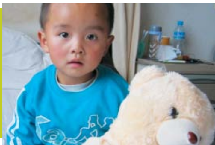
A patient at Children's HeartLink partner site First Hospital of Lanzhou University in Lanzhou, China.

In October 2010, Children's HeartLink and a volunteer medical team from the University of Minnesota Amplatz Children's Hospital visited the First Hospital of Lanzhou University (FHLU) in Lanzhou, China, for a cardiac training visit. This was Children's HeartLink's ninth visit in over 10 years of partnership with FHLU.