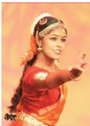
Students of Ragamala Dance perform at the 2010 HeartLink Gala.