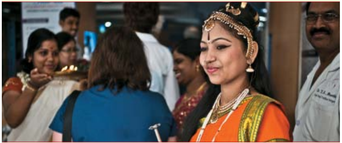
Staff at Innova Children's Heart Hospital welcome medical volunteers during a cardiac training visit.