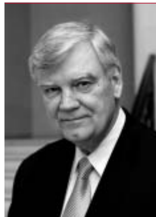
J. Brian Atwood Brian Atwood is the Chair of the OECD Development Assistance Committee. From 2002 until 2010 he served as Dean of the Hubert Humphrey Institute of Public Affairs at the University of Minnesota and was Administrator of the U.S. Agency for International Development (USAID) from 1993 to 1999.