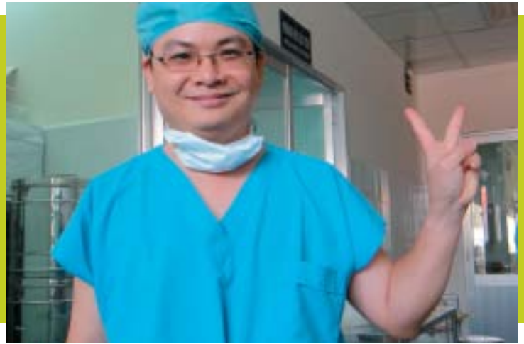
A surgeon at Nhi Dong 1, Children's HeartLink partner site in Ho Chi Minh City, Vietnam.